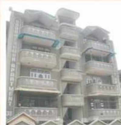
Doodeshwar Apartment, Shalimar Garden, Sahibabad, Ghaziabad (Completed in 2001)

Our group was Estd. in the year 1998. We are engaged in fulfilling and presenting your dream home which is economically budgeted yet zero compromise with quality thus meeting all the requirements of a good and healthy living in lush green surrounding and pollution free environment. The core objective is to cater the need of quality housing and timely delivery as in Doodheshwar Apartment at Shalimar Garden, Krishna Residency at Raj Nagar, Krishna Vihar at Pratap Vihar, Krishna Kunj at Nehru Nagar, Krishna Apartment at Patel Nagar, Krishna Villa at Model Town and Shoppers Square at Raj Nagar in Ghaziabad.