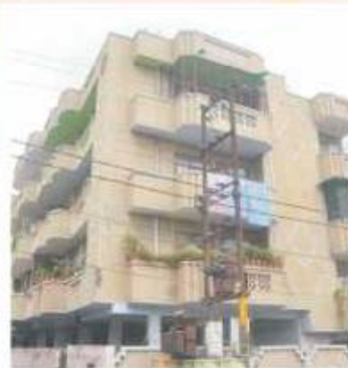
Krishna Kunj, Nehru Nagar-III, Ghaziabad (Completed in 2003)