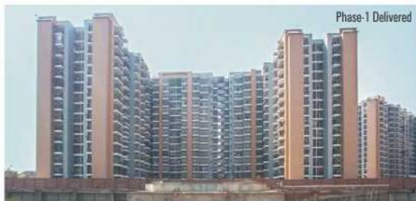
Saviour Park, Mohan Nagar, Ghaziabad (Phase-1 Delivered in 2015)