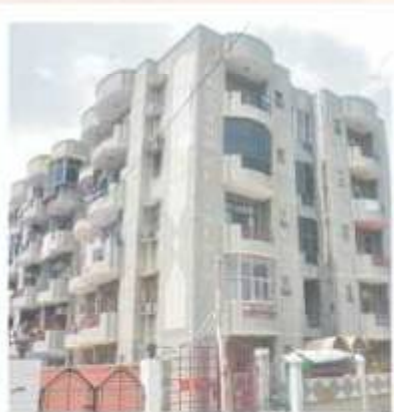
Krishna Residency, Raj Nagar, Ghaziabad (Completed in 2004)