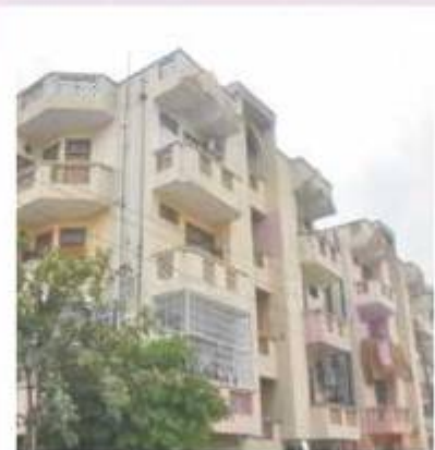
Krishna Vihar, Pratap Vihar, Ghaziabad (Completed in 2005)